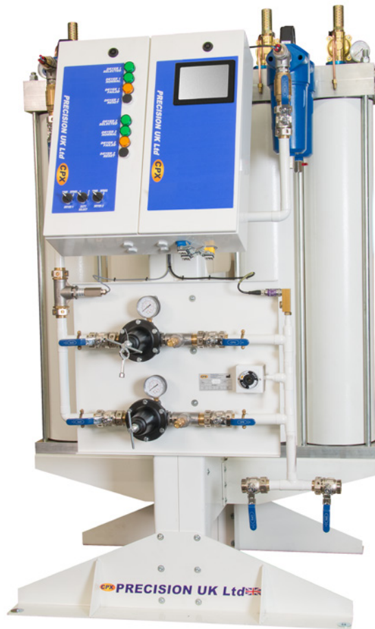
Touchscreen Control Medical Air Dryer Unit

Precision UK's CPX Medical Air Plant is manufactured under BS EN 13485 Medical Devices: Quality Management Systems. It provides a centralised source of medical air, available in simplex to multi-pump configurations dependant on individual requirement.