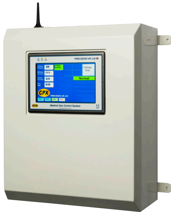
Touchscreen SHTM02-01 Compliant Automatic Manifold Control Panel

Precision UK's CPX Automatic Manifold Plant is manufactured under BS EN 13485 Medical Devices: Quality Management Systems.